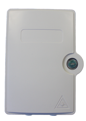
Appearance of HTTB-C01