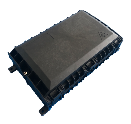
Appearance of HTSC-150A