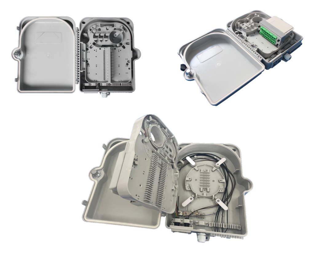
HTTB-X24-Tary023 product picture