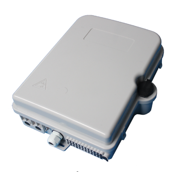
Appearance of HTTB-X24-Tary023