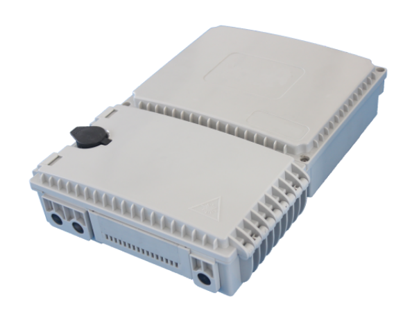
Appearance of HTTB-X16