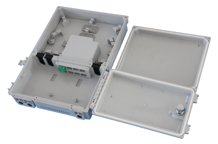
HTTB-X16 product picture