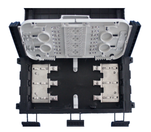
HTSC-146 product picture