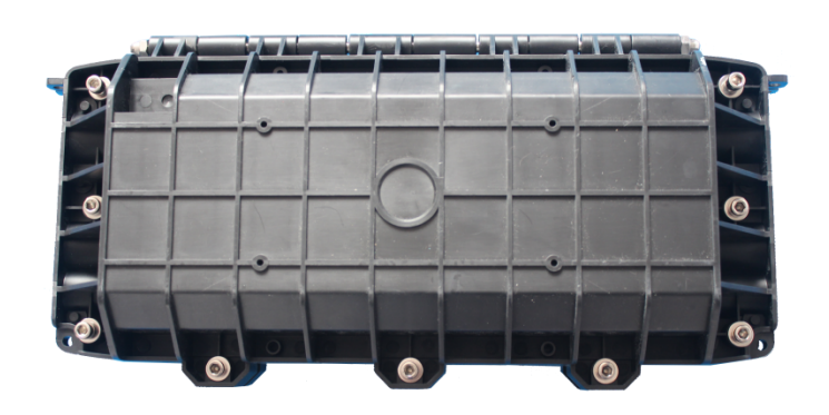
Appearance of HTSC-116