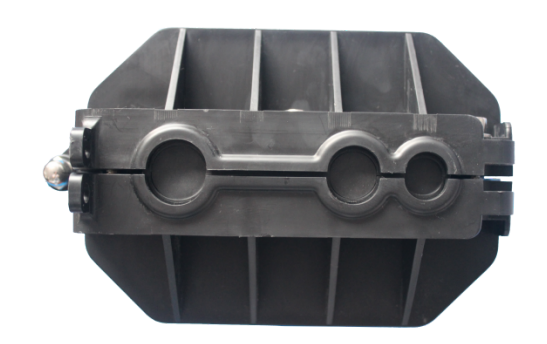
HTSC-116 product picture