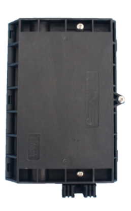
Appearance of HTSC-F05