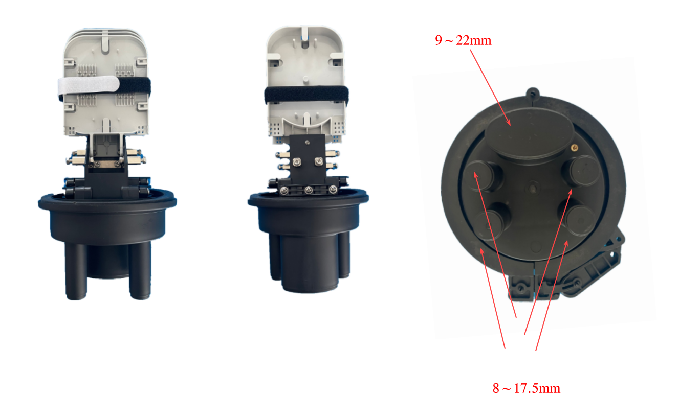
HTSC-214 product picture