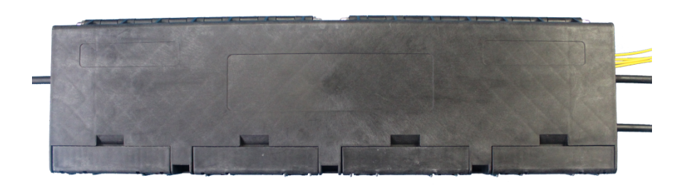
Appearance of HTSC-133