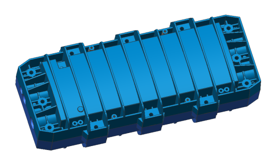
Appearance of HTSC-104B