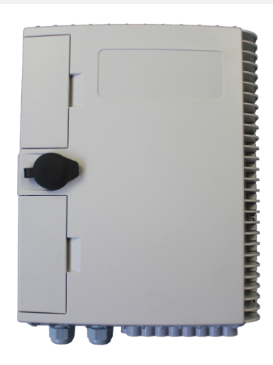
Appearance of HTTB-X21