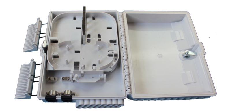
HTTB-X21 product picture