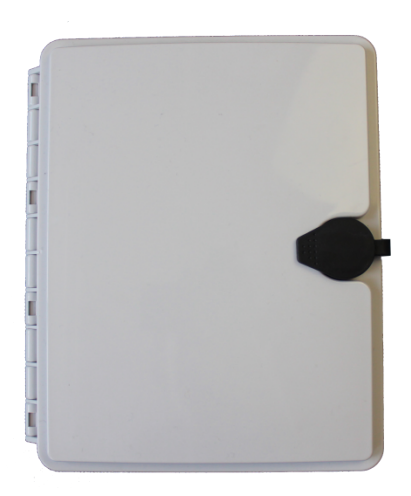
Appearance of HTTB-X08B