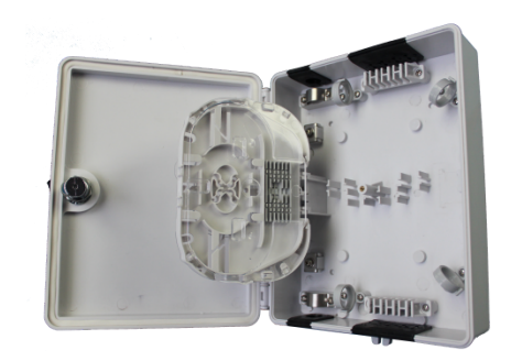
HTTB-X08B product picture