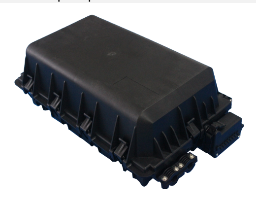
Appearance of HTSC-TL16