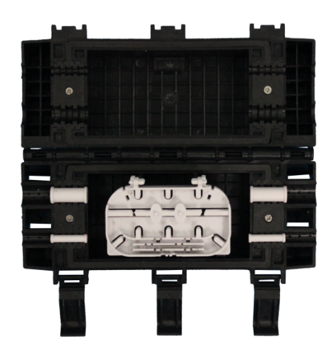
HTSC-F03 product picture