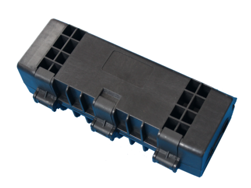
Appearance of HTSC-F03