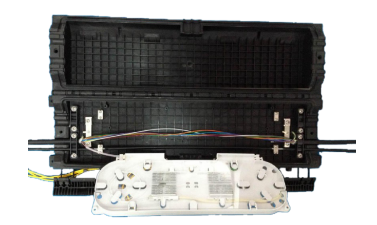
HTSC-132 product picture